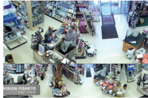
Dewarped Image: 2 PTZ views & 1 360 degree view